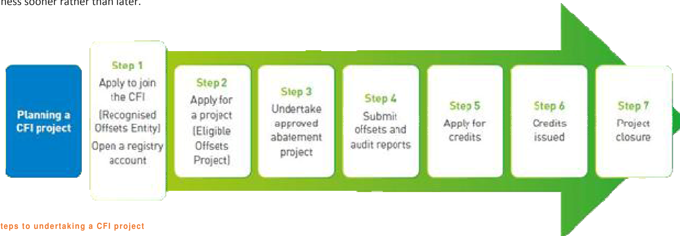
Steps to undertaking a CFI project